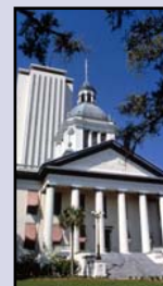
Florida Capitol Complex in Tallahassee

Includes an FAU display all day on the 3rd floor of the Capitol and an FAU reception in the evening.