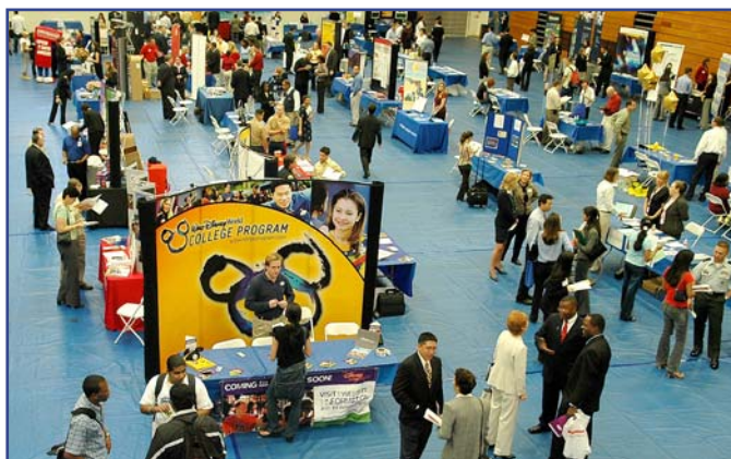
Last month's Career Day brought together hundreds of students and potential employers in the gym on the Boca Raton campus. FAU's Career Development Centers have also implemented Interfase, a web-based system connecting students searching for employment and internships with employers and organizations looking for employees. Employers and prospective employees can visit www.fau.edu/cdc for more information.