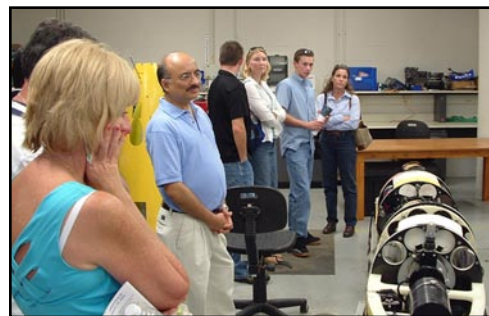
Recently, the Department of Ocean Engineering hosted an open house for prospective students, including tours of SeaTech labs and facilities.

The 2005 FAU Days gave Florida's governing officials a reminder of the important role FAU plays in Southeast Florida, the rest of the state and the world through its seven campuses, 25,000 students and more than 130 degree programs.