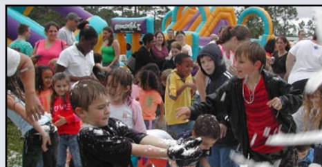
Last month, students and their families frolicked on Snow Day, an annual event the Treasure Coast Campus Student Government hosts to bring a little winter to South Florida.

REMINDER Commencement is May 6. Look for a preview in next month's Update .